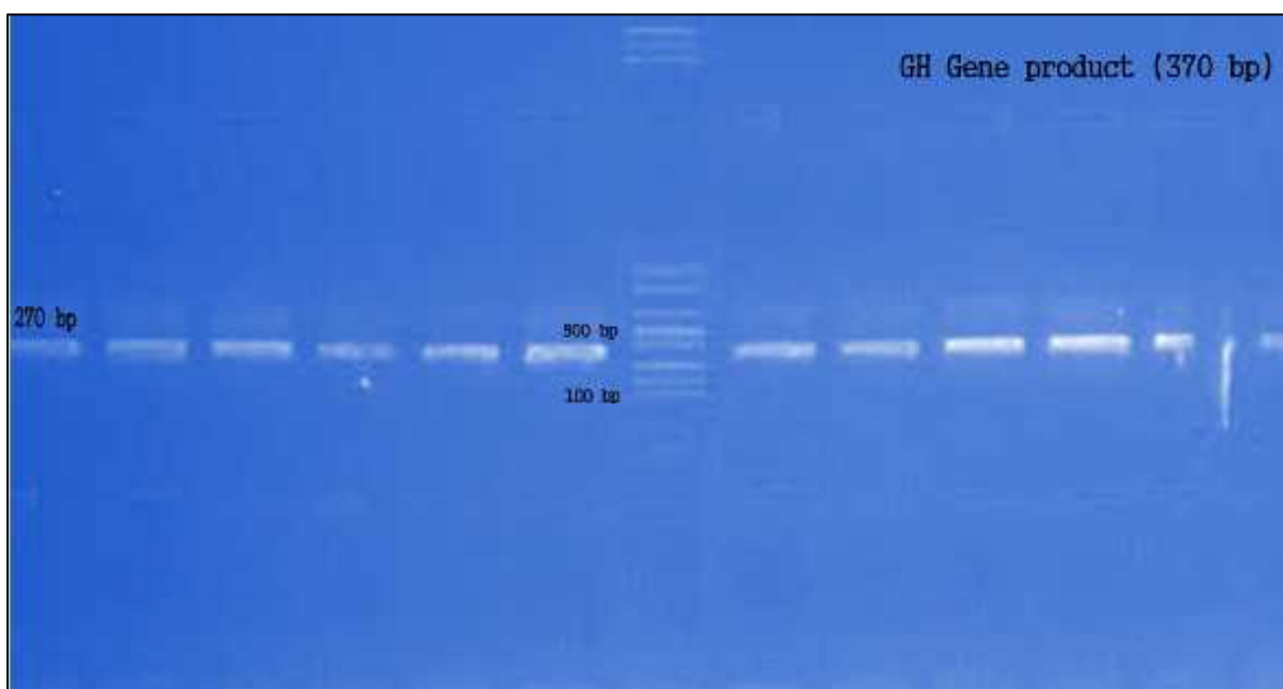
Fig. (2): PCR product for the GH.